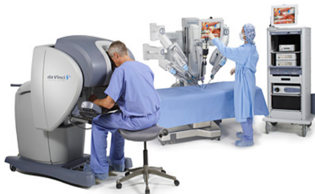
da Vinci™ Surgical System

Laparoscopy is performed by filling the belly with carbon dioxide gas so that a working space can be created. Small incisions are created through which the instruments are passed. For removal of the mass and kidney reconstruction, 5 small incisions between ¼ and ½ inch are used. The robot holds 3 instruments and the camera. Once the surgeon and his assistant properly set the robot, he then sits down at a robotic console from where the robotic arms are controlled using hand and foot controls. A table side assistant surgeon helps by passing instruments and aiding in the dissection.