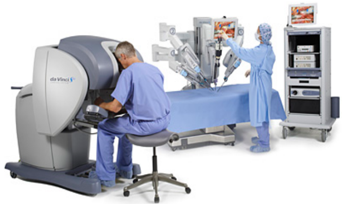
da Vinci™ Surgical System

Laparoscopy is performed by filling the belly with carbon dioxide gas so that a working space can be created. Small incisions are created through which the instruments are passed. For kidney reconstruction, 4 small incisions between ¼ and ½ inch are used. The robot holds 2 instruments and the camera. Once the surgeon and his assistant properly set the robot, he then sits down at a robotic console from where the robotic arms are controlled using hand and foot controls. A table side assistant surgeon helps by passing instruments and aiding in the dissection.